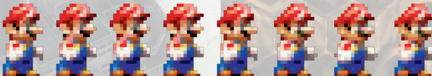
Background: DoDonPachi Dai-Ou-Jou (arcade)

But this animation comes at a familiar cost. Mario has no eyes, his hands are occasionally hooked and the brim of his hat disappears twice. Our familiar hero has become a flickery mess of smoothly animated pixels.