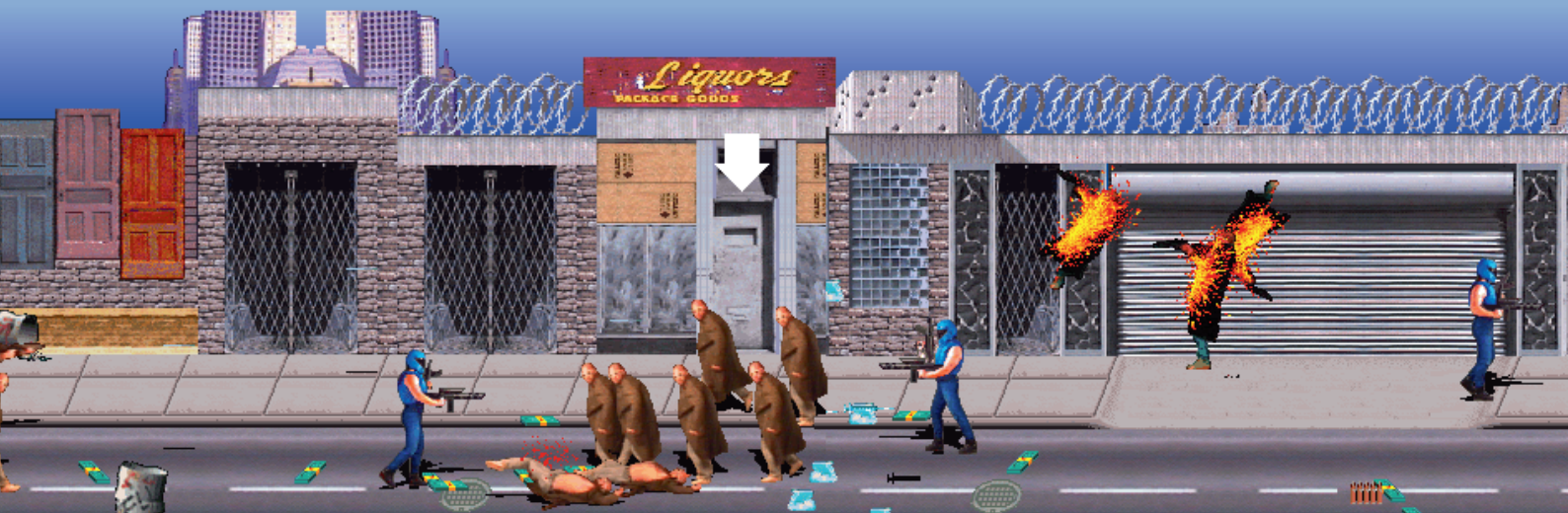
Below: NARC (arcade)

It didn't hurt that Donkey Kong Country was an exceptionally good game, featuring one of Nintendo's oldest characters, but it was the graphics that got all the attention.